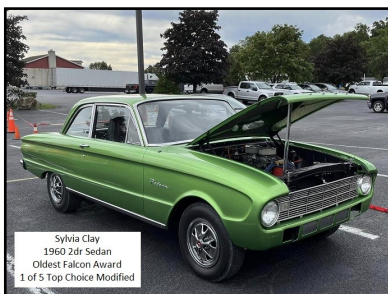
Sylvia Clay 1960 2dr Sedan Oldest Falcon Award 1 of 5 Top Choice Modified