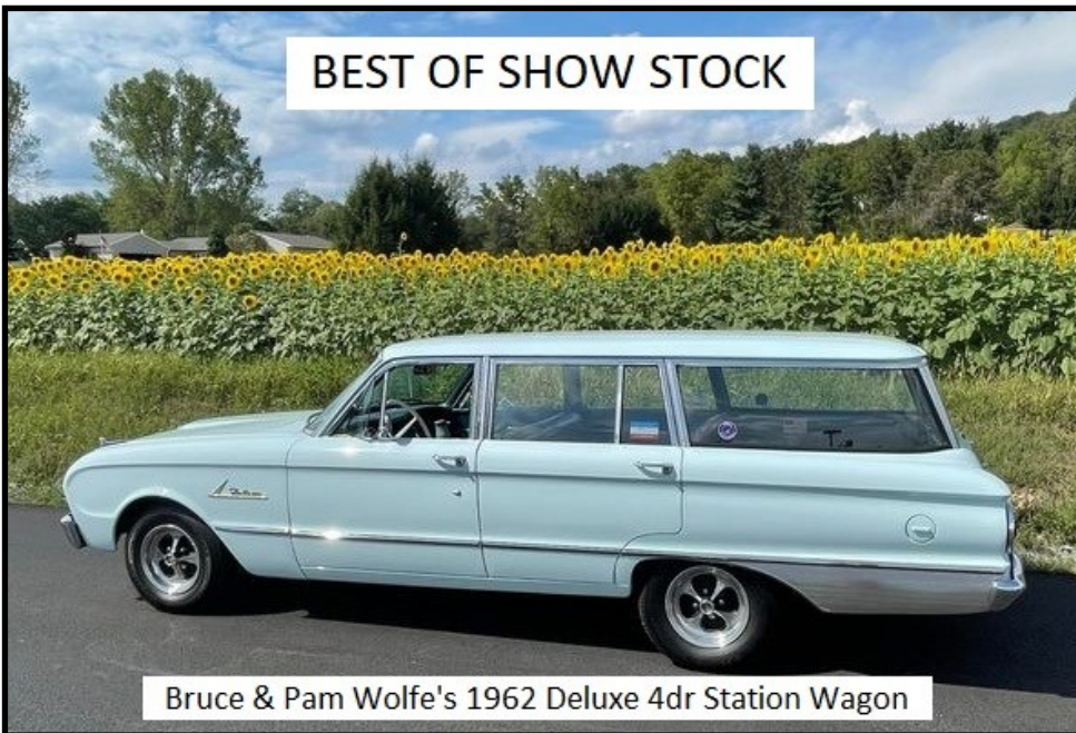
Bruce & Pam Wolfe's 1962 Deluxe 4dr Station Wagon