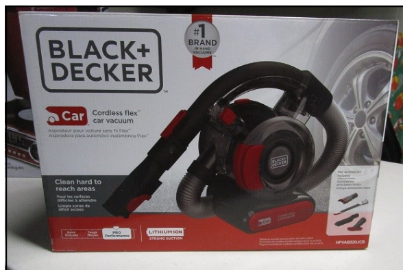
BLACK & DECKER VACUUM SWEEPER