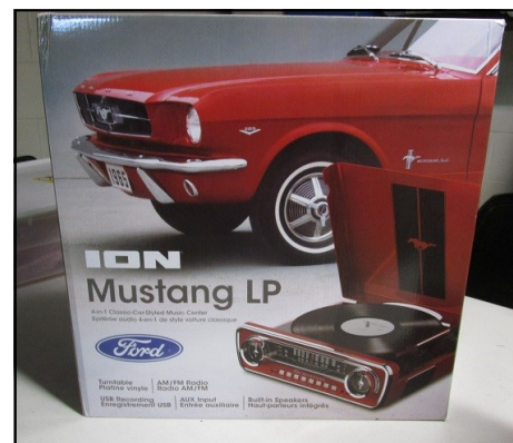
ION LP PLAYER