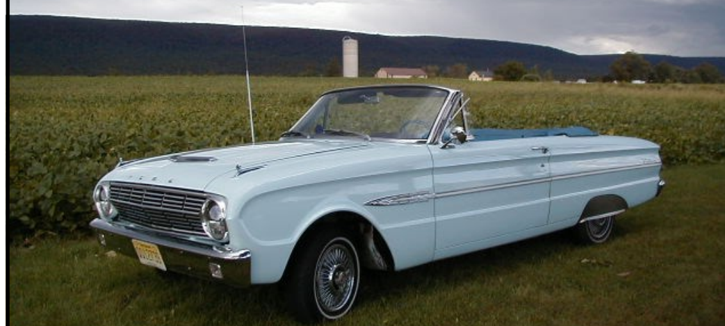
KEVIN AND LAUREN GABEL'S 1963 FUTURA

LET'S USE THE "WAY BACK MACHINE" 22 YEARS AGO