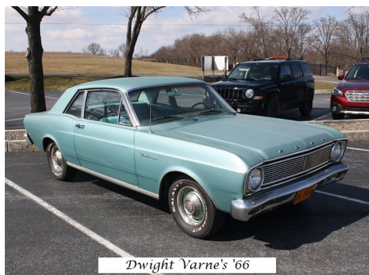
Dwight Varne's '66