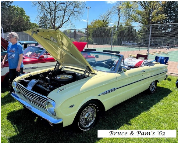
Bruce & Pam's '63