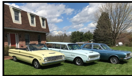
Grantville Covid Car Show