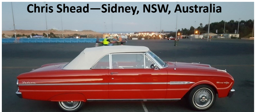
1963 Sprint Conv. in Rangoon Red