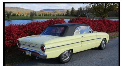
Burning Bush 63