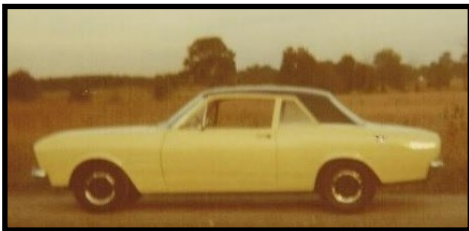
First Falcon in 1970