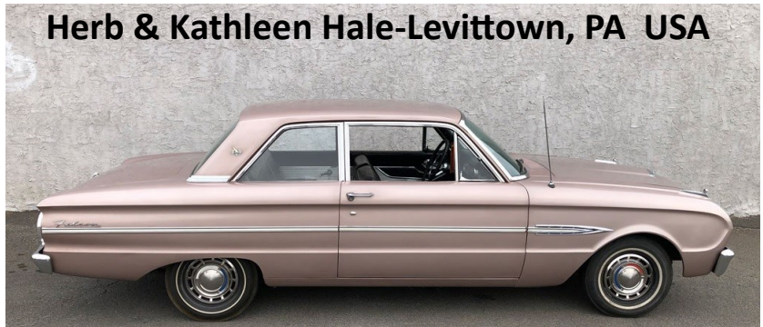
1963 2 DR Sedan in Rose Beige