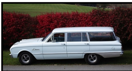
Burning Bush 62