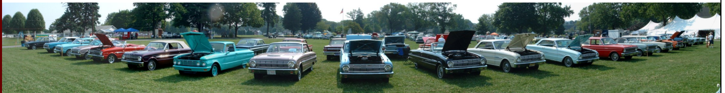
Macungie Line Up 2007

MORE SCHEDULE DETAILS IN THE NEXT NEWSLETTER