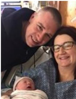
One of their other Babies >>