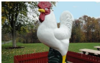
DON'T MISS THE CABIN FEVER MEET @ KAUFFMANS 3/20/16