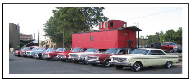
A line up of the Georgia Chapter Falcons.