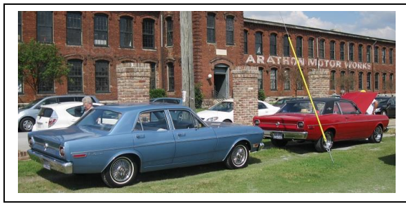
'68s in Nashville, TN at the “American Picker’s” store. The building was a Marathon Motors car factory.