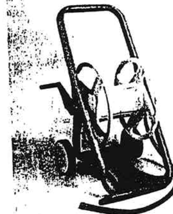
SMC "FALCON" HOSE REEL