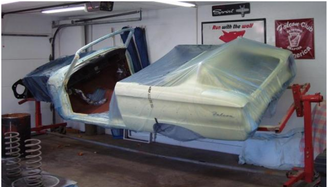
Winter Project - Photo Submitted by: Bruce Wolfe

Two time recipient of the coveted Old Cars Weekly "Golden Quill Award"