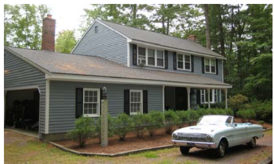
Our Falcon and its new home