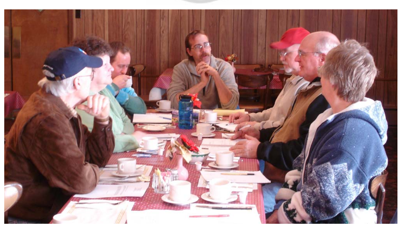
Getting Down to Business - January 9, 2010 - Photo by: Frank Servas

Two time recipient of the coveted Old Cars Weekly "Golden Zuill Award"