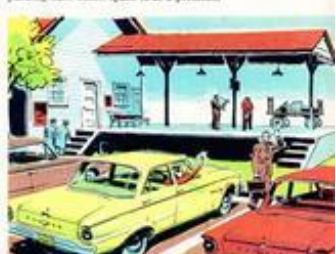
Economy: Outstanding gas savings in stop-and-go commuter travel as well as in highway driving makes Falcon first choice of all budget-conscious drivers