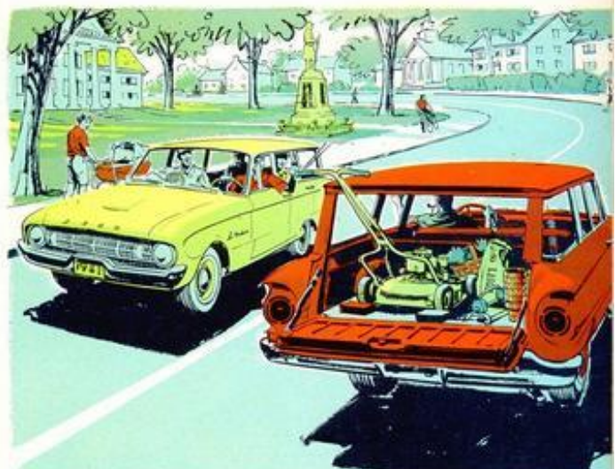
Station wagon versatility: Falcon wagons combine all-around utility built into all Ford wagons with special operating and maintenance economies found only in Falcon sedans. The only way you can compare wagons as economy cars is by their price tags. They are truly America's best wagon values.