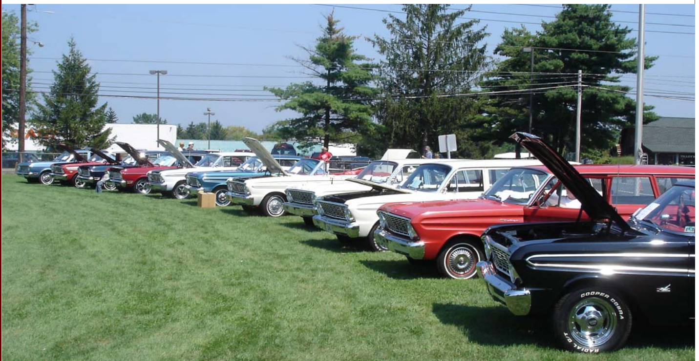
Falcons at Coopersburg - August 16, 2009

Two time recipient of the coveted Old Cars Weekly "Golden Quill Award"