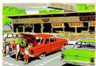
Around-town convenience: Falcon is unmatched for easy, effortless maneuverability in traffic and for parking ease where space is at a premium