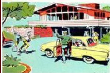
Six passenger comfort: Not just a "second" car, Falcon seats six adults comfortably, fulfills all transportation needs of families working but one car