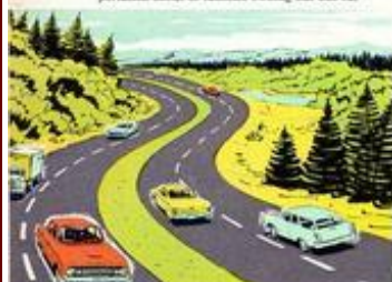
Roadability: Sure-footed at highway and toropike speeds, combines big-car stability and compact car handling ease for relaxing long-distance driving