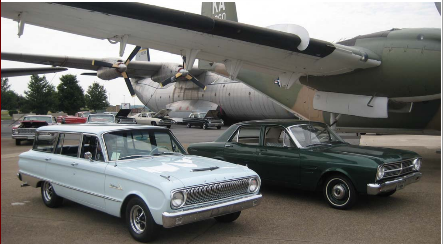
Dover Air Force Base Museum - July 17, 2009

Two time recipient of the coveted Old Cars Weekly "Golden Quill Award"