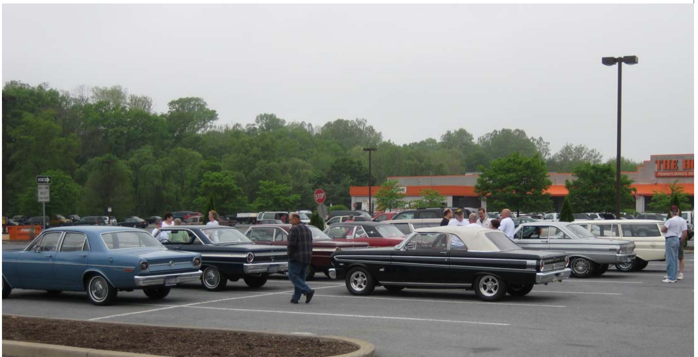
Waiting to "Cruise" to the America on Wheels Museum - May 16, 2009

First time recipient of the coveted Old Cars Weekly "Golden Quill Award"