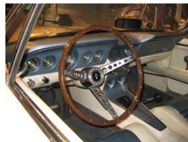
Mustang II Concept Vehicle As seen at the America on Wheels Museum