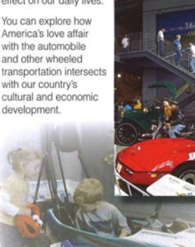
The Exhibits America On Wheels features more than cars. As a museum of over-the-road-transportation, we are the home of all modes of wheeled transportation including bicycles, trucks and carriages in addition to our car collection. The museum features a Changing

As you travel through the museum, you will discover that all of our exhibits are connected by the fascinating story of over-the-road-transportation's effect on our daily lives.