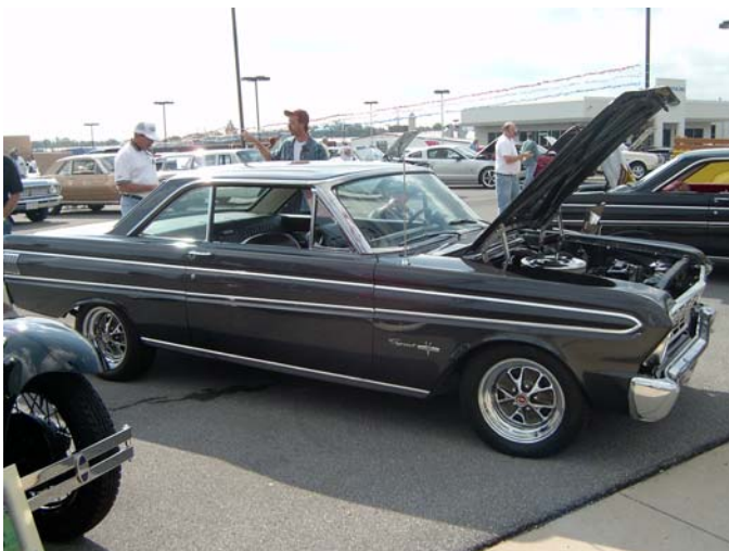
L.B. Smith Ford 2007

It was a Thursday morning in May around 7AM that a