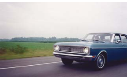
On the Road - Springfield National 1996