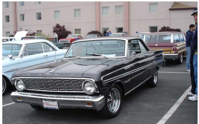
Keystone Regional - 2008

We are the fifth owners of our charcoal gray 1964 Falcon Sprint (compact muscle car) with a 2-speed 260 (bored 30 over) AT, AC, and bucket seats. We entered our Falcon in 5 shows and won one trophy this summer, and we are enjoying meeting and talking to present and past Falcon owners.