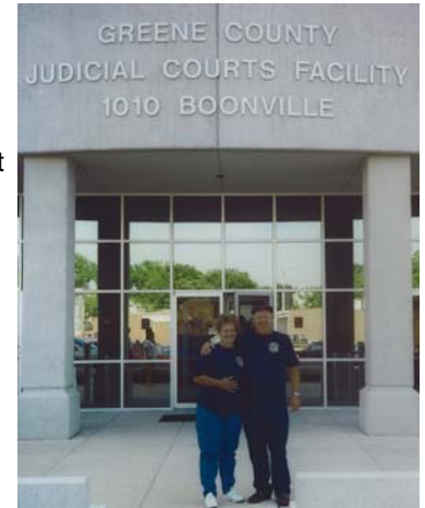
The new husband & wife 1996