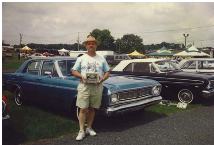
Carlisle All Ford Show 1996 - Class Award