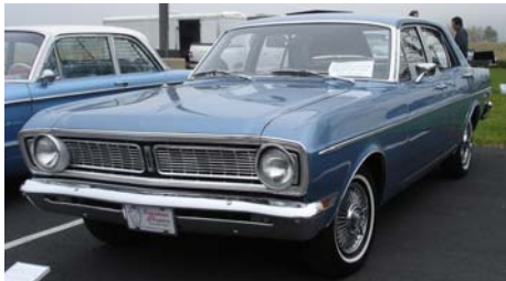
Keystone Regional - 2008