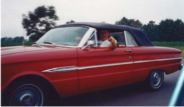
On the Road - Springfield National 1996