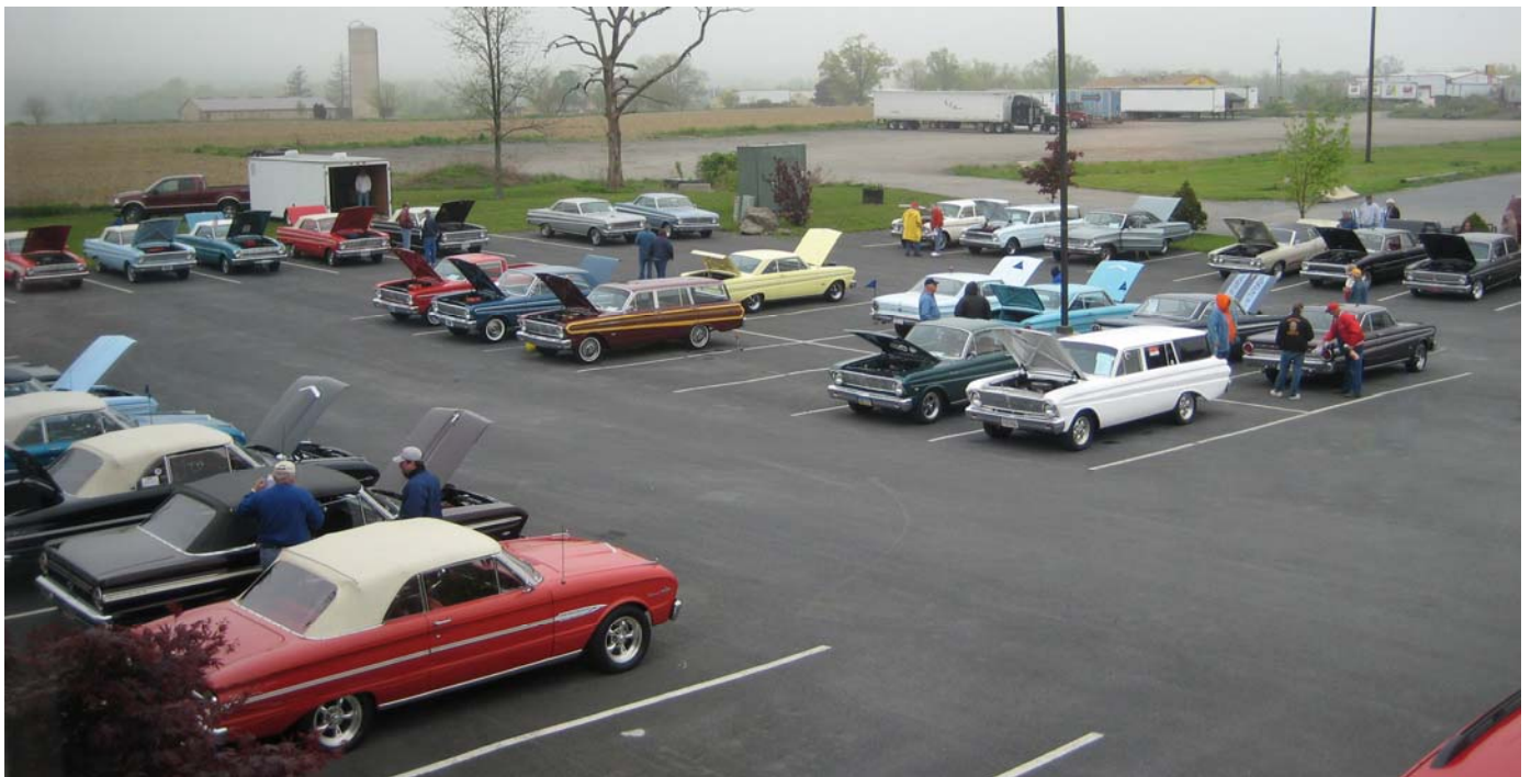
Falcons on hand - Keystone Regional Meet - May 3, 2008

First time recipient of the coveted Old Cars Weekly "Golden Quill Award"