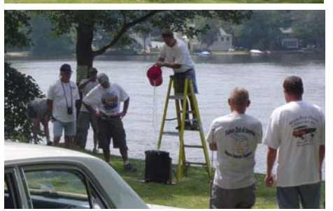
Northeast Regional 2007 - Photos by Kevin Gabel